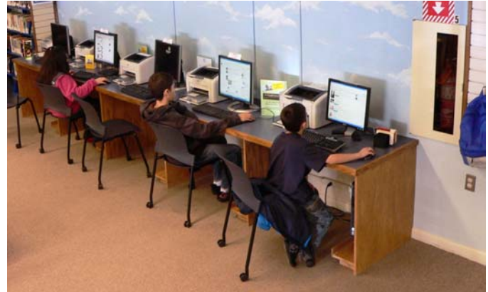
Three students work with the computers in the children’s department.

Further information and applications are available at the Rocky Hill High School Guidance Department and the Cora J. Belden Library. The winning essay on “Why our public library is important to me and our community” will be published in the next edition of The Library Window.